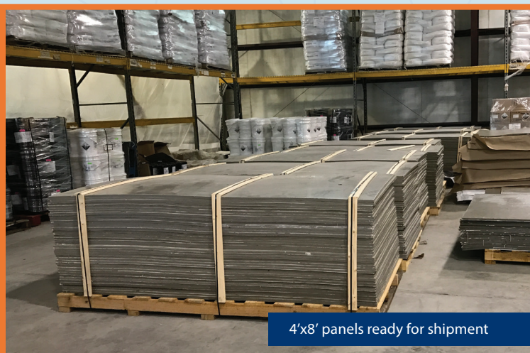
4'x8' panels ready for shipment

Can be installed quickly in 4'x8' precast panels or hand placed in horizontal and formed in vertical applications.